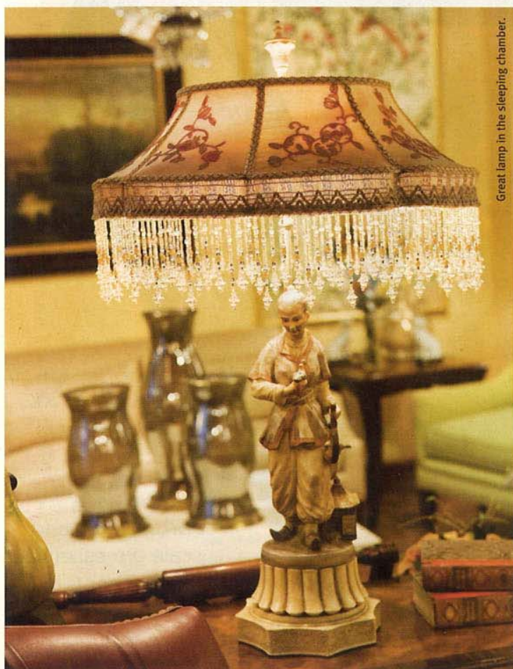
Great lamp in the sleeping chamber.