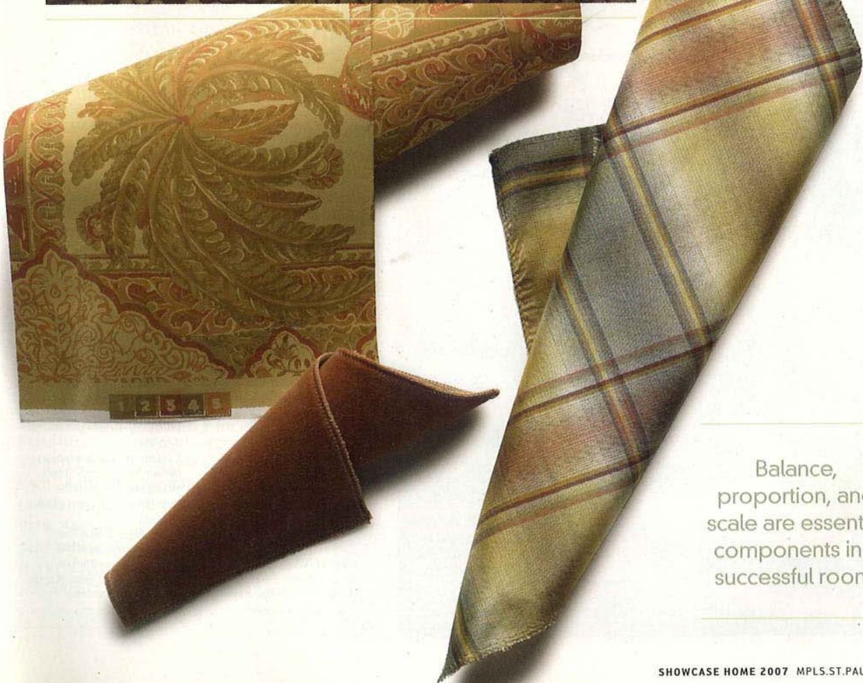
Detail of rug by Odegard

Balance, proportion, and scale are essential components in a successful room.