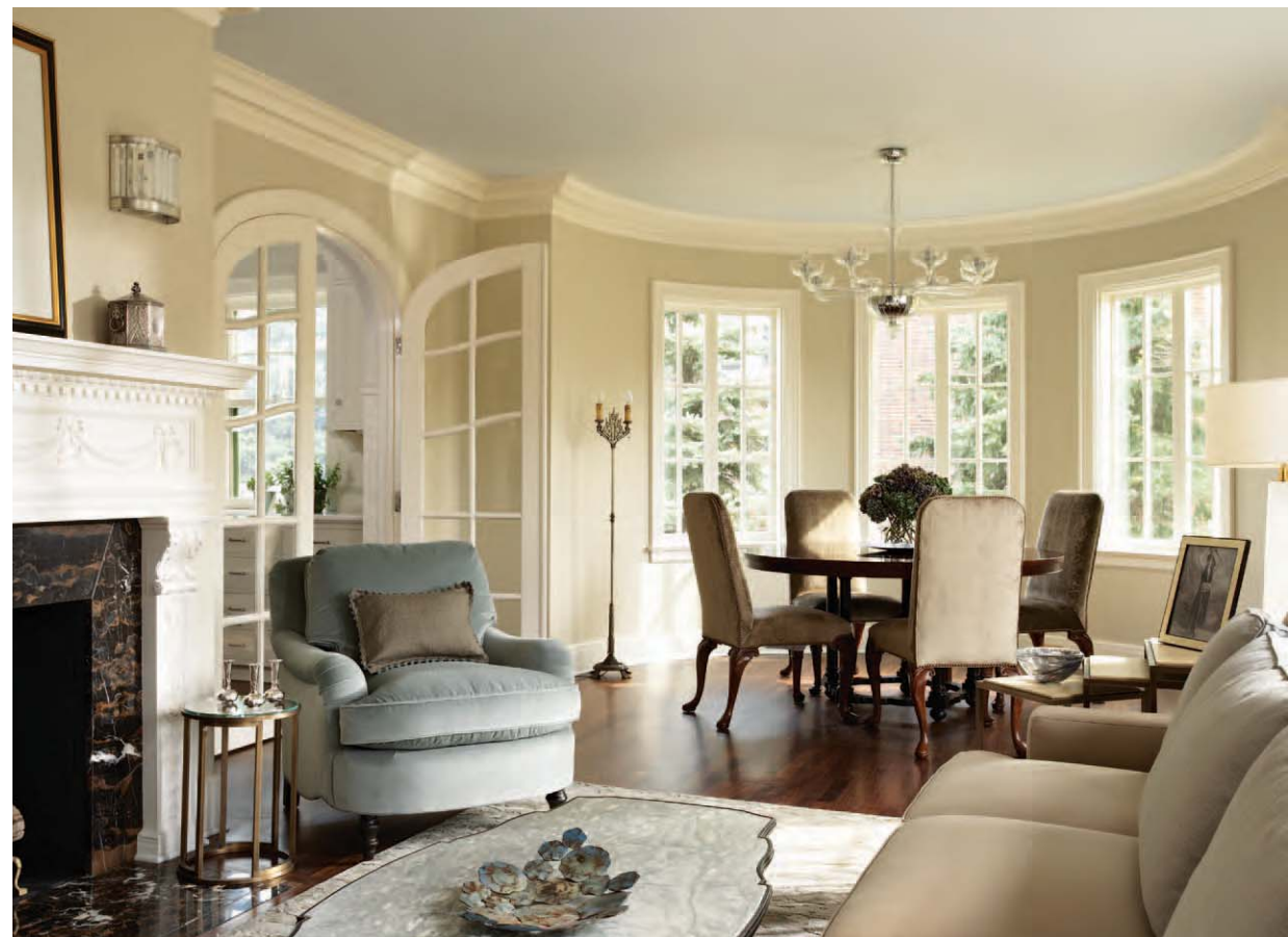
ABOVE, RIGHT The Olsons' living room opens to a lovely, window-surrounded dining area. The fireplace mantel, marble surround and hearth, and the arched-top glass door were restored to their original splendor.