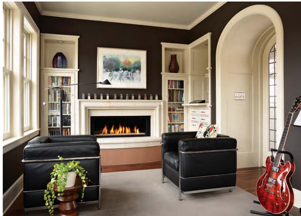
ABOVE The Siggs' music room features a new gas fireplace and built-in shelving and desk. The deep gray walls make the space feel cozy and modern, but also make the period millwork pop.