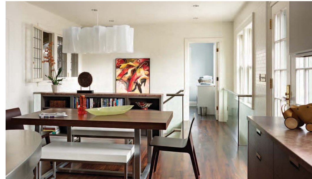
FAMILY