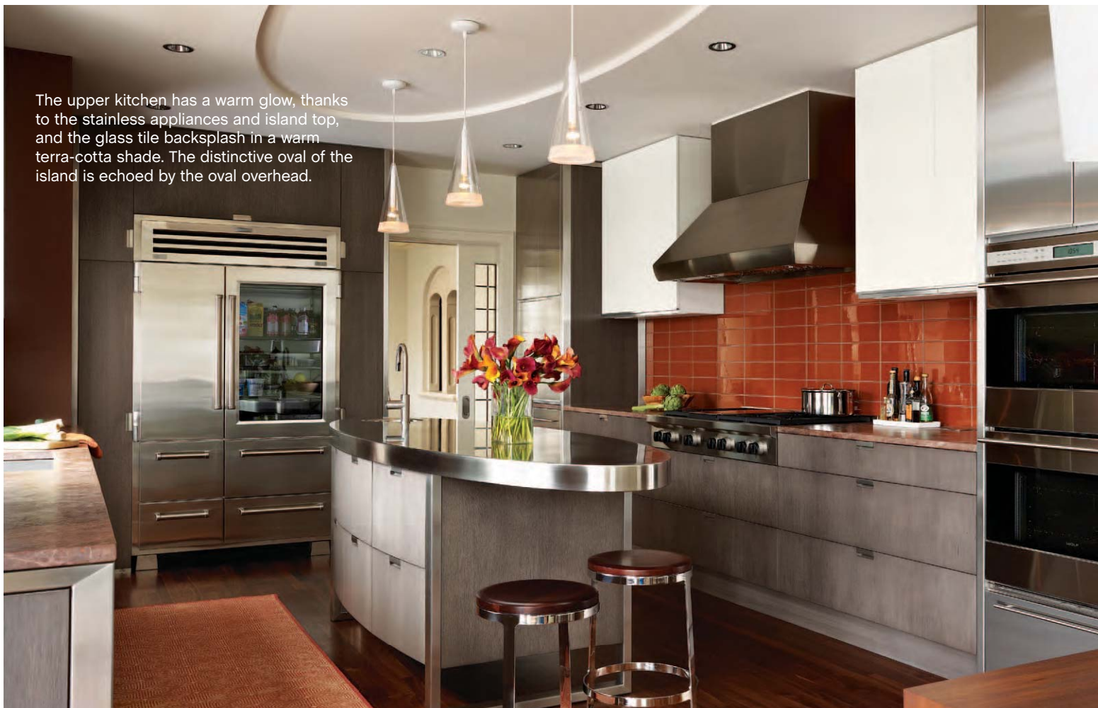
The upper kitchen has a warm glow, thanks to the stainless appliances and island top, and the glass tile backsplash in a warm terra-cotta shade. The distinctive oval of the island is echoed by the oval overhead.