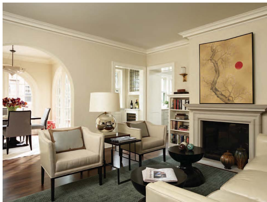
ABOVE The first floor family room is adjacent the new breakfast room addition.