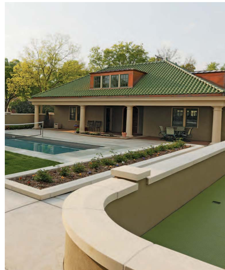
ABOVE The renovation included a new garage, pool, and tennis court.