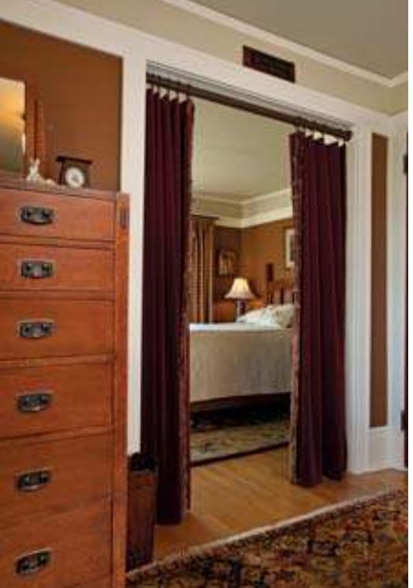
ABOVE: Vintage velvet portières frame the view from the dressing room into the bedroom. The bed and tall dresser are reissued pieces by Stickley. RIGHT: The new powder room has a painted cabinet designed by David Heide set off by black wall paint and tile in 'Derby Brown' from Mission Tile West. OPPOSITE BOTTOM: "The Stag," a period design by C.F.A. Voysey produced by J.R. Burrows, is framed in the breakfast room. This table is an antique Stickley Bros. piece.

room, a new surround for the fireplace is made up of organic 'Pea Pod' tiles in a matte ochre color from Mud Pi Tiles. Hardwood floors were in good shape under the old mint-green broadloom. A warren of small rooms upstairs was reworked into a master suite and dressing room, and an open study/library.