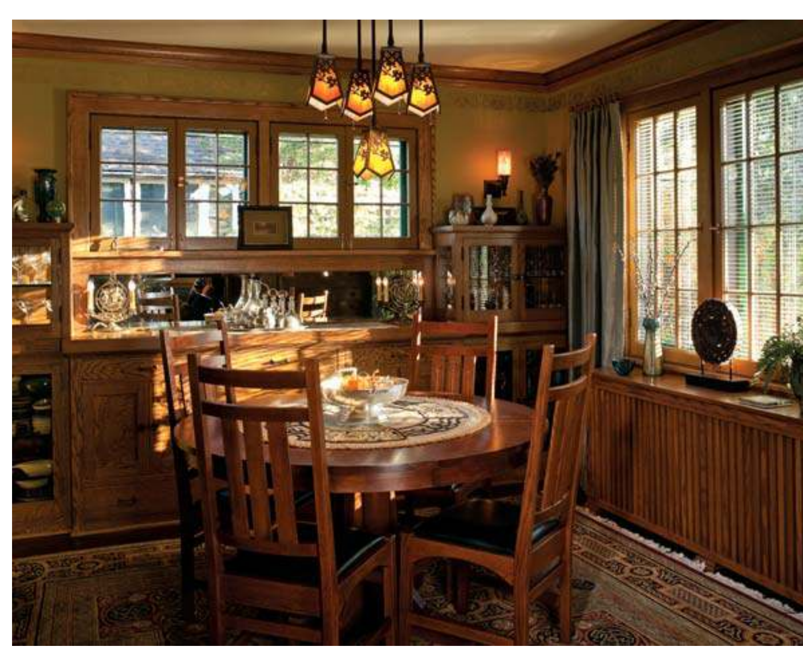
The dining room has Stickley furniture softened by earthy paint colors and a subtle stencil. The overhead light fixture is antique; the sconces were designed by David Heide with shades by Lundberg Studios.

THE EXTERIOR A new paint scheme in a Craftsman palette brings out the best in the house (which had earlier been done up in green and white). The off-center front entry block breaks up the cubic massing. Welcoming new elements, including the framed address tiles, wood door with glass, and wall lanterns, are keyed to the period. ENTRY DOOR Simpson Door: simpsondoor.com LANTERNS, MAILBOX Arroyo Craftsman: arroyo-craftsman.com TILE North Prairie Tileworks: handmadetile.com KNOCKER Craftsmen Hardware Co.: craftsmenhardware.com UMBRELLA STAND Antique