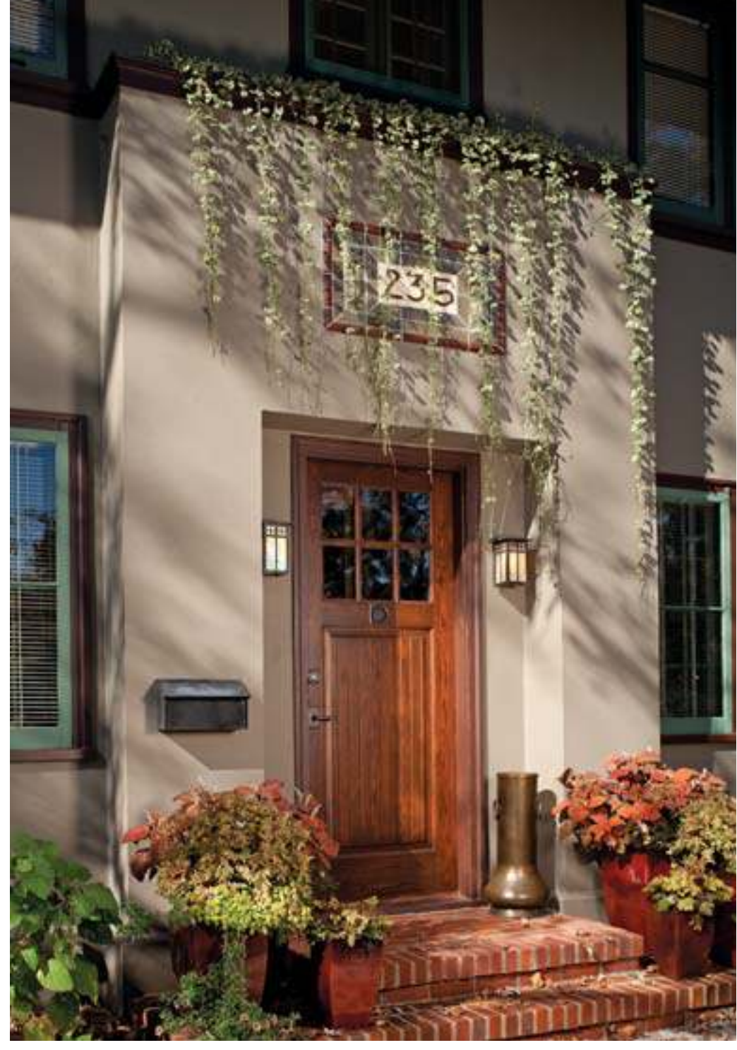
RIGHT: A bump-out accentuates the front entry, now handsomely restored and embellished with period accents. BELOW: The Limbert chair holds a "Forget Me Not" pillow made from antique embroidery.