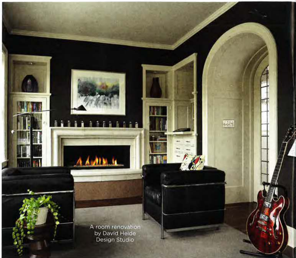
A room renovation by David Heide Design Studio

Whether it's summer and you're trying to stay cool, or the dead of a Minnesota winter and you're simply trying to ease the chill, home temperature regulation is key. Bonfe's offers a four-hour "Quick Heat Response" service guarantee,