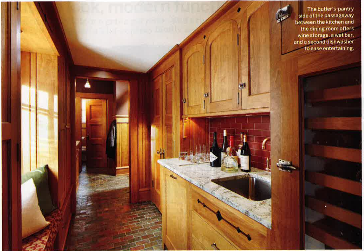
The butler's-pantry side of the passageway between the kitchen and the dining room offers wine storage, a wet bar, and a second dishwasher to ease entertaining.