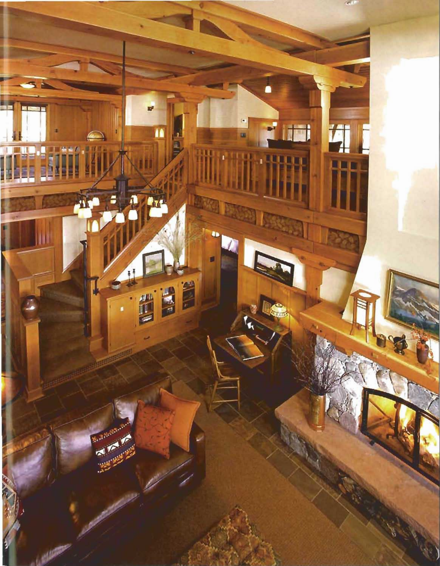
THE LIVING ROOM IS THE CENTERPIECE OF THE HOME - IT IS BOTH THE PRIMARY GATHERING AREA AND THE ROOM MOST ALIVE IN ARCHITECTURAL DETAILS, NOT ALL OF THEM OBVIOUS. THE WOOD PANELING TO THE LEFT OF THE HEARTH OPENS TO REVEAL A TELEVISION AND ENTERTAINMENT SYSTEM, AND THE SPEAKERS! THEY'RE HIDDEN BEHIND THE LEAFY TEXTILE FRIEZE BELOW THE LOFT AREA.