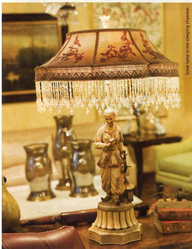
Great lamp in the sleeping chamber.