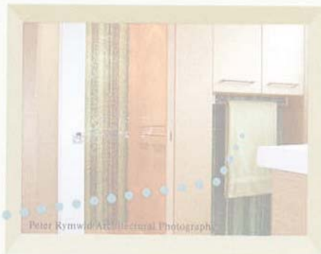
Create the best use for spaces with integrated storage solutions.

Note that front-loading washers offer a smaller footprint and some models can be stacked with dryers to free up more space for storage cabinets. Some of the front-loading machines offer storage under the units or pull out storage beside the units. One other item to consider in the laundry room is a built-in ironing board or one that pulls out from a cabinet drawer. If there's no broom closet, make sure you install a hanging device designed to hold